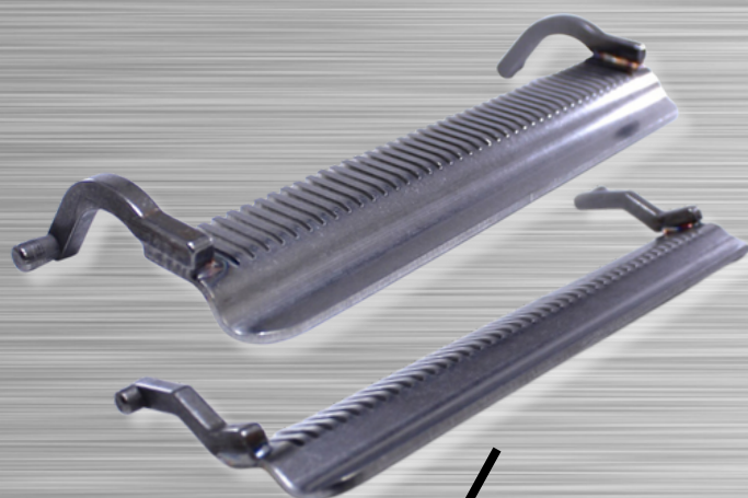
Rear & Front Stripper Sku#: HT101F, HT102B