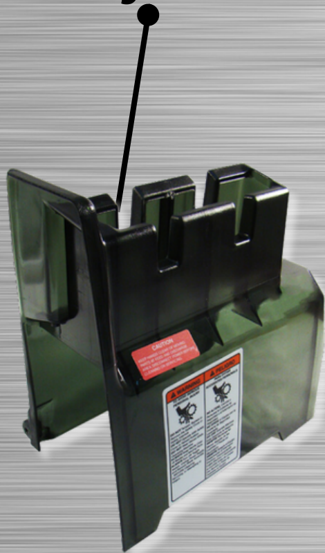
Sku#: HT120 Safety Cover