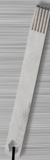
Cleaning Fork Sku#: HX400