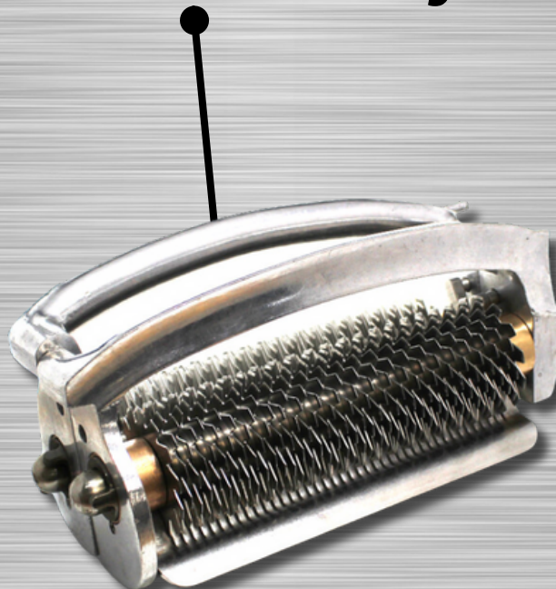
Sku#: HT111A Cradle Assembly